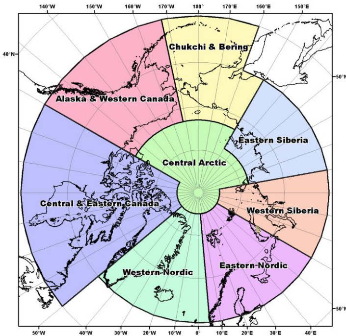
Fig. 2. The geographical domain for ArcRCC-N products.